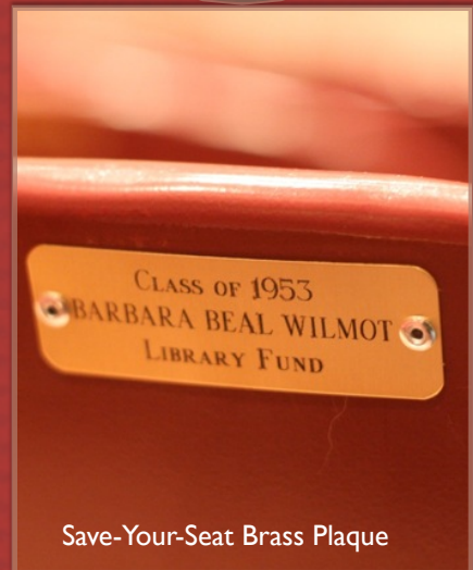
Save-Your-Seat Brass Plaque