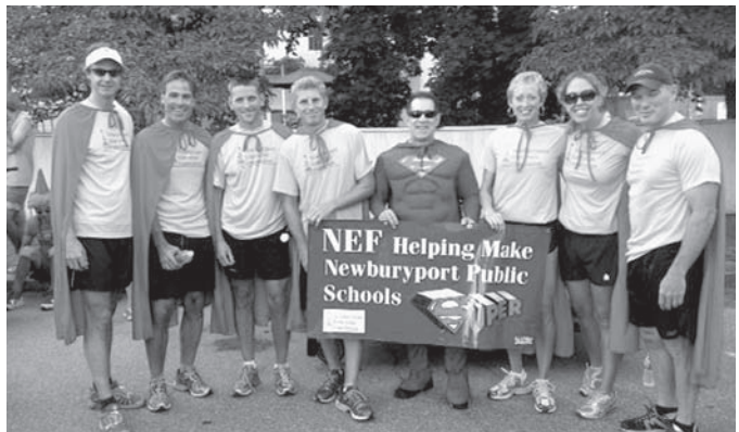
Yankee Homecoming Bed Race, 2011