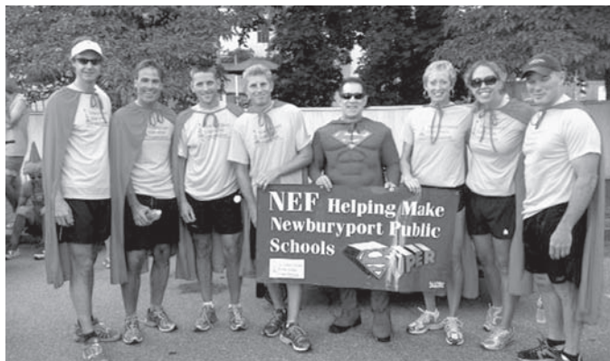
Yankee Homecoming Bed Race, 2011